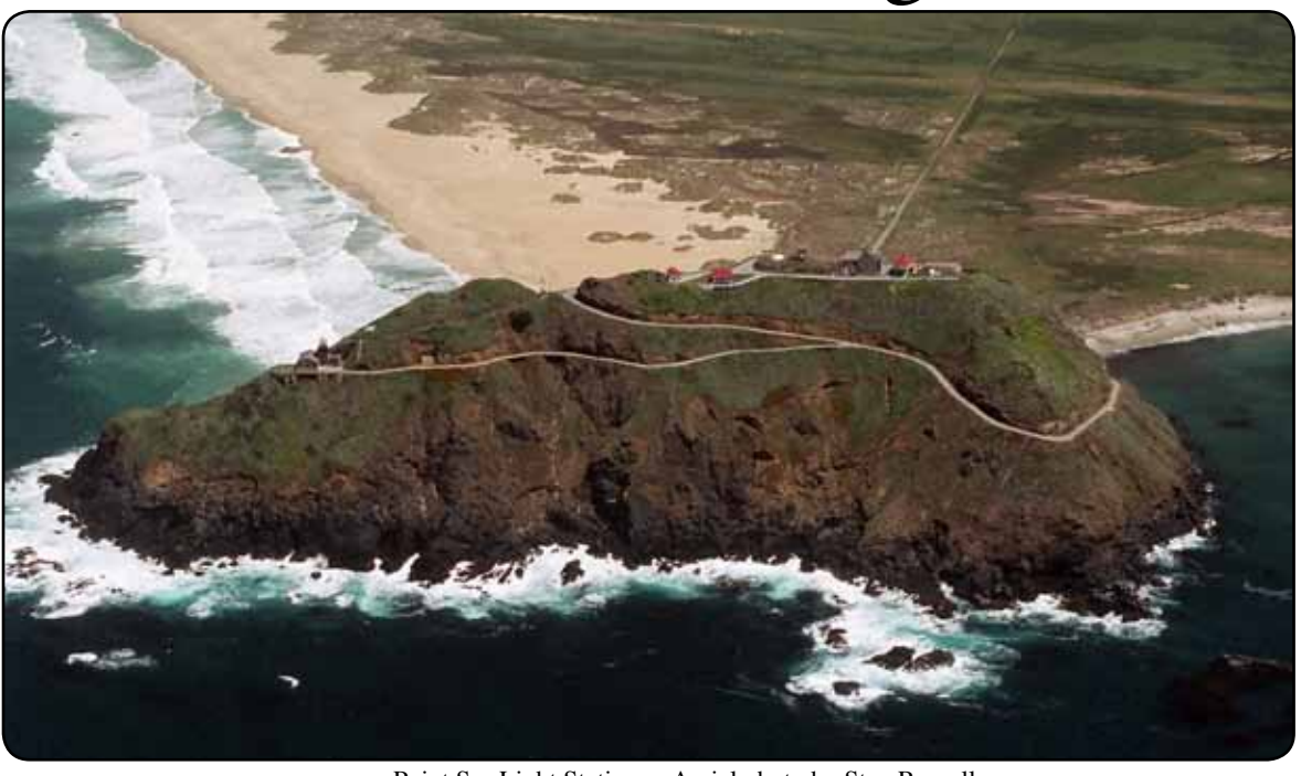
Point Sur Light Station

For information regarding guided tours, check the interpretive notices posted in the state parks, or call (831) 625-4419 for more information. Trained volunteer docents provide an informative and pleasurable tour to the visiting public, and provide access to the Point Sur Lightstation. Visit us on the web at www.pointsur.org