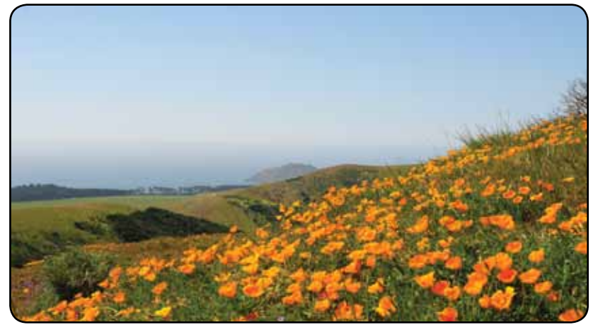
California poppies. Old Coast Road to Point Sur