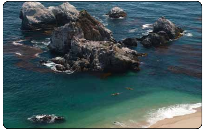
McWay Rocks & kayakers, JP Burns State Park

Evenings offer the opportunity to dine in restaurants from fanciful to exquisite. Relax in lodging that ranges from rustic to ultra-luxurious. Camp out in the many well equipped campgrounds. Luxuriate at the health spas. And of course, one of the favorite ways to pass the time in Big Sur is to simply Do Nothing .