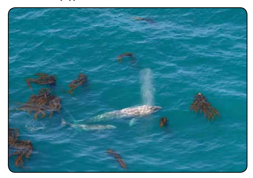
Gray whale and calf on annual migration to Alaska