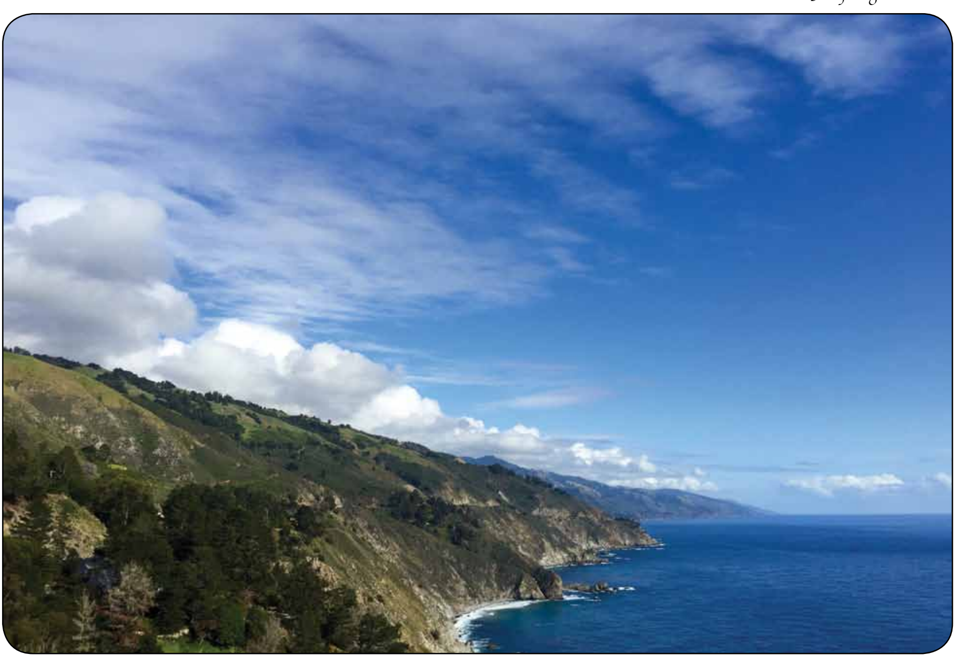
Big Sur Coastline ~ Partington Point