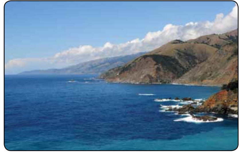
Big Creek Bridge and Big Sur coastline