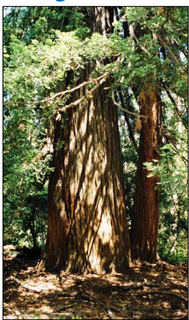
1,100 year old Colonial Redwood tree in Pfeiffer Big Sur State State Park