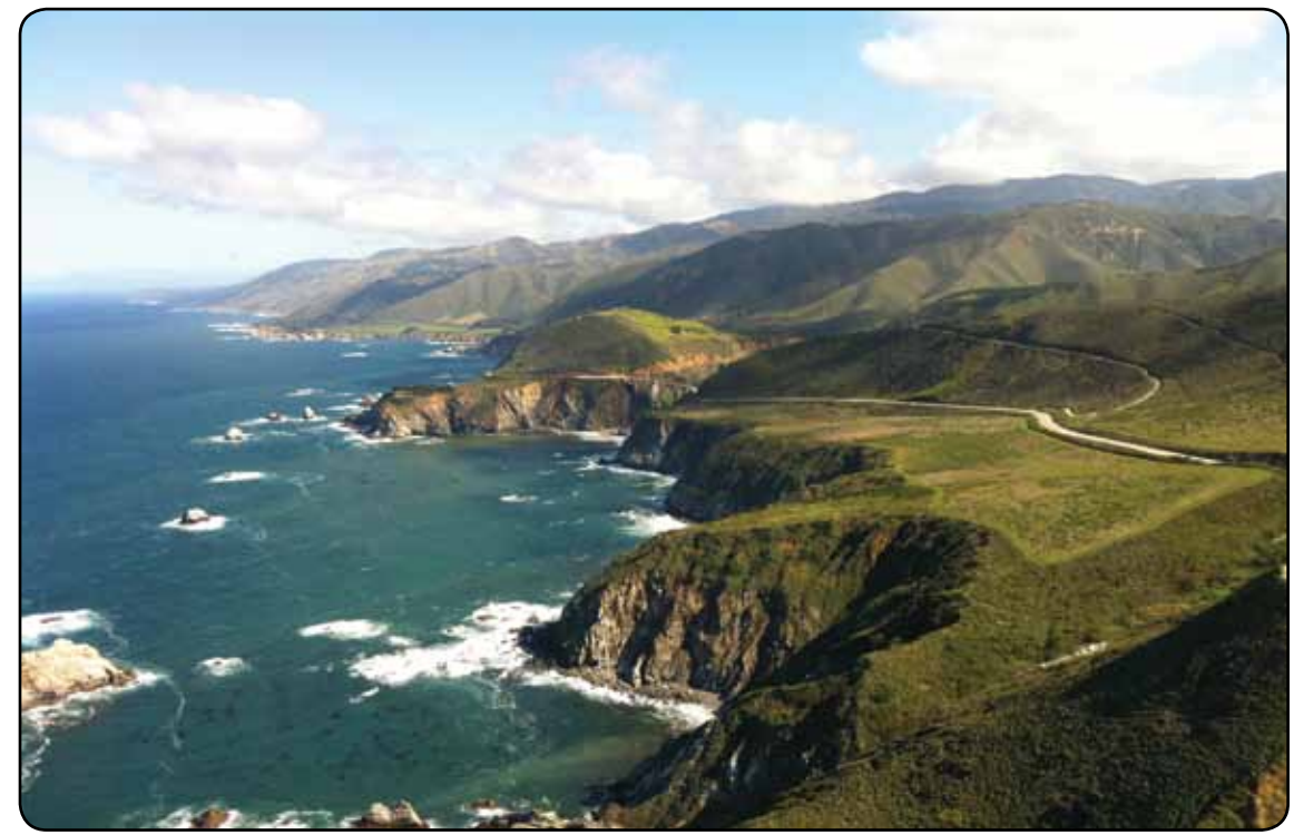
Bixby Bridge from Hurricane Point

www.mst.org 1-888-MST-BUS1 (1-888-678-2871)