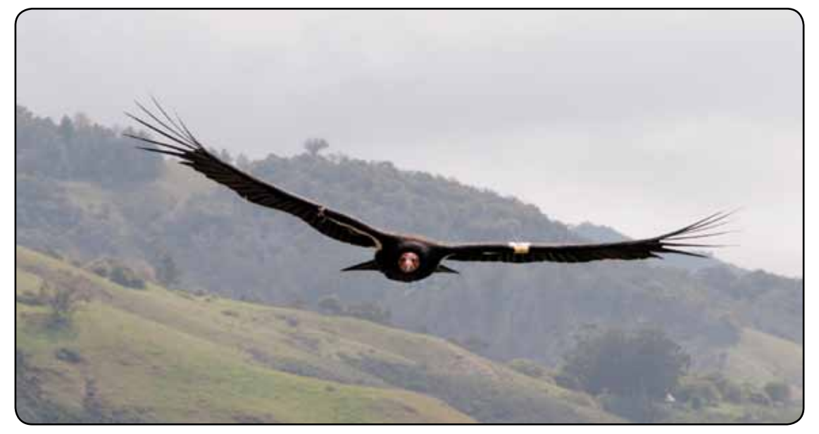
Rare California Condor in flight (9.5 ft wingspan)