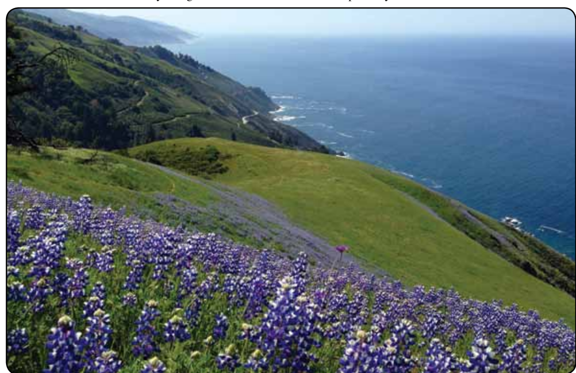
Lupine wildflower bloom on the Baronda Trail ~ Photo by Stan Russell