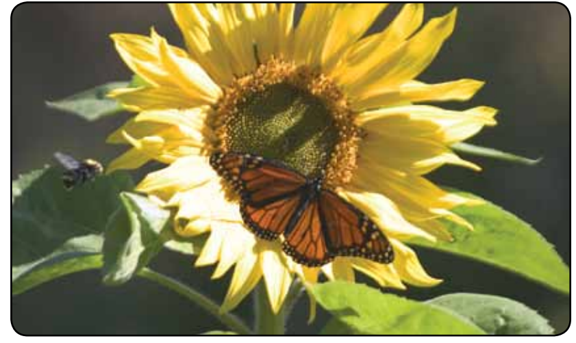
Monarch butterfly on its annual migration