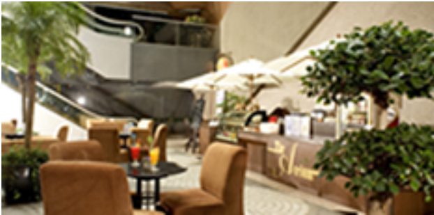
YMCA International House, Hong Kong