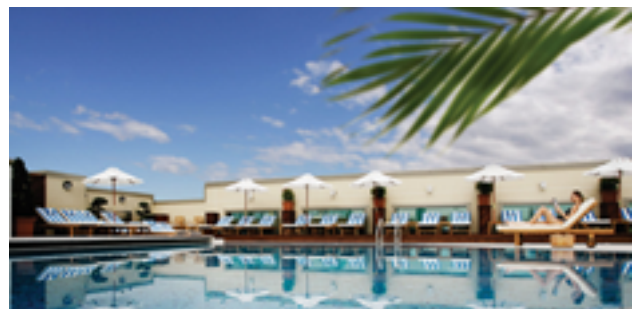
InterContinental Grand Stanford Hong Kong

A distinctive hotel in the heart of Mongkok. Home to Chuan Spa introducing one of the first luxury spas to specialise in traditional Chinese medicine, while offering all the international treatments and massages you have come to expect. Step outside the hotel and you have the bustling streets of authentic Hong Kong boasting some of the best local shopping with the Ladies Market nearby.