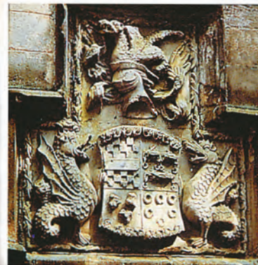
Below: The arms of John Clifford, 9th Lord of Skipton ("The Butcher"), with wyvern sejant crest and two wyvern supporters.