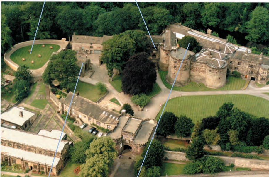
The 13th century chapel of St. John the evangelist